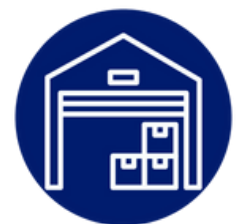
Warehousing and Industrial Buildings