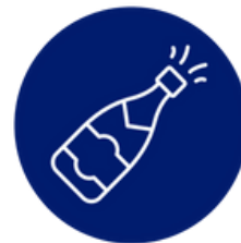
Events and Festivals