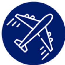
Aviation and Military