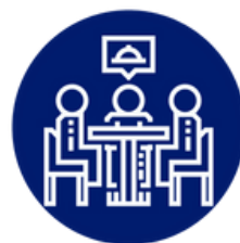
Staff Canteen and Kitchens