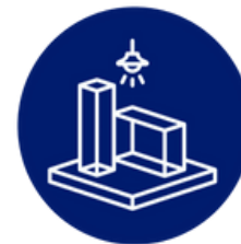
Exhibitions and Corporate Events