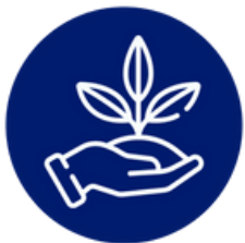
Agricultural Structure Solutions

At the heart of a Speed Structure is a structural aluminum frame with various cladding options ranging from double PVC coated fabric to glass panels.