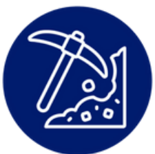
Mining and Construction